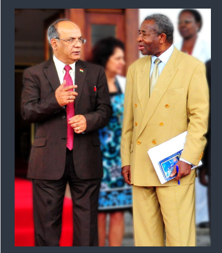
Discussing details of a Project for Development of Uganda's Agriculture Sector with Hon Tress Bucyanayandi Ugandan Minister of Agriculture, Industry & Fisheries